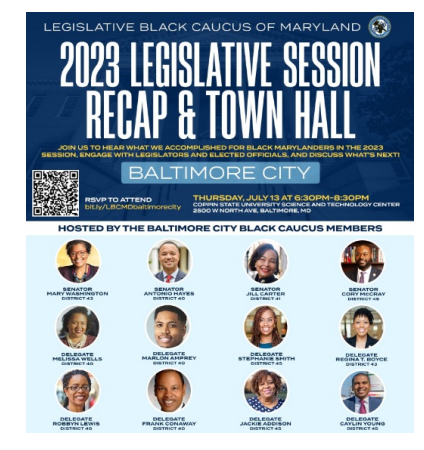
Baltimore City Delegation - LBC of Maryland Town Hall, Coppin State University