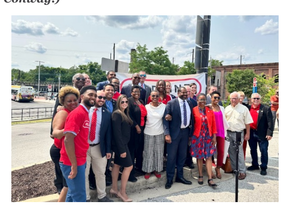
Baltimore City and Baltimore County State Delegations showing regional pride at the MDOT Red Line Relaunch Announcement