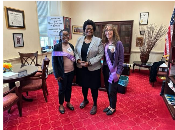
Meeting with advocates from the Alzheimer's Association