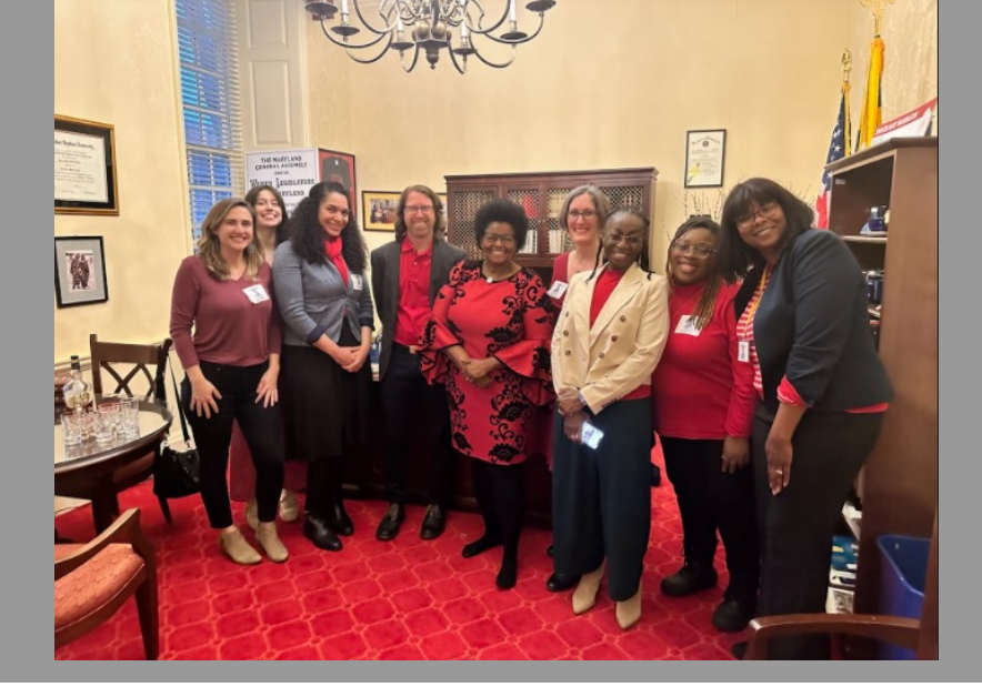
Wearing Red on March 10th - the day of the social work bill hearings - in solidarity with Social Workers for Equality and Ending Racism (SWEAR)