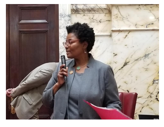
Tis the Season for Floor Reports

"I am writing with abundant gratitude for your brilliant and compassionate comments in support of Senate Bill 686, the Child Victims Act, on the floor