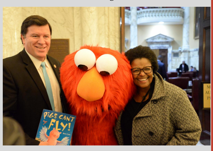
With Senator Brian Simonaire and Elmo on National Read Across America Day